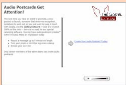
Audio/Visual Post Card