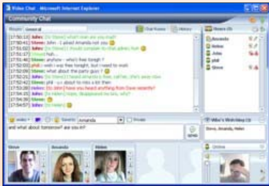
Web Video Chat